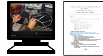
Modular education board